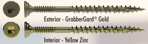
Exterior - GrabberGard® Gold

GrabberGard. Lifetime Warranty Pressure treated lumber approved