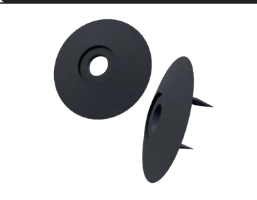
#610 Thermal-Grip® with Insulation stabilizing prongs