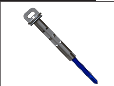
#75 Original Pos-I-Tie®