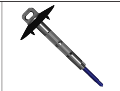
Thermal-Grip® installed on Original Pos-I-Tie®