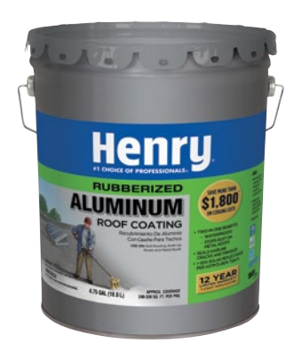
12-year limited warranty