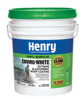
12-year limited warranty