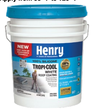
Lifetime limited warranty