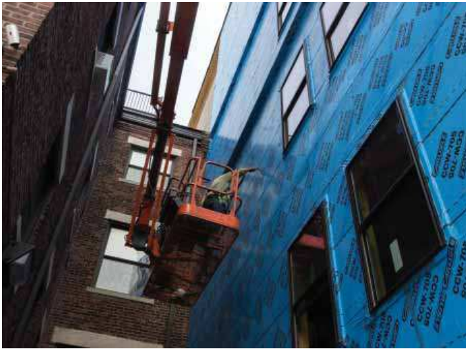
CCW-705 Air & Vapor Barrier Strips Application.

CCW-705 Air & Vapor Barrier Strips are of similar composition to CCW-705 Air & Vapor Barrier, but are slit to narrower widths for convenient application. CCW-705 Air & Vapor Barrier Strips are offered in 100' rolls of 4", 6", 9" and 12" widths. The product is applied in a similar manner to CCW-705 Air & Vapor Barrier and is used to provide protection in critical areas such as window openings, transitions, terminations and joints.