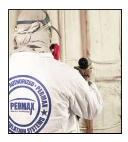
PERMAX<sup>™</sup> Spray Foam Insulation Slash your energy bills with PERMAX<sup>™</sup> spray polyurethane foam (SPF) technology.