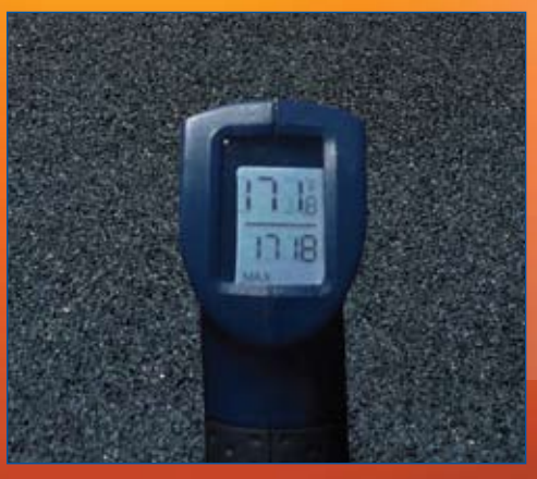
Uncoated black granulated roof = 171°F