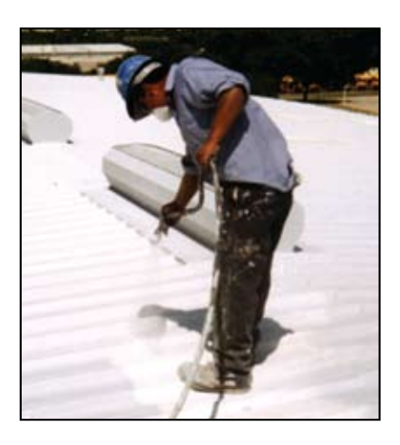
Henry Maintenance Systems Why reroof when you can restore? Save thousands of dollars with our roof restoration systems.

For more than 75 years, Henry has been the construction industry's most trusted source for complete building solutions. From foundation to roof, Henry products and systems manage the flow of air, water and vapor through the building envelope, improving a structure's energy efficiency, sustainability and livability.