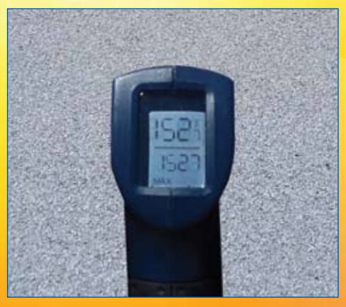
Uncoated white granulated roof = 152°F