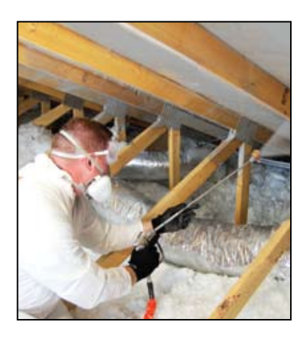
LiquidFoil™ Attic Barrier Have a pitched roof with an attic? Save energy with LiquidFoil™ Attic Barrier.