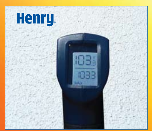
White coated granulated roof = 103°F

Thanks to special Dirt Pick-Up Resistant (DPR) technology, Henry's 687 Enviro-White™ outperforms ordinary roofs, lowering temperatures dramatically to help building and home owners across the country cut energy costs. The photos below, all taken at the same time in Phoenix, Arizona, demonstrate just how dramatic the temperature difference can be. The Henry cool roof white reflective coating (top left) is 49°F cooler than the white, uncoated roof (top right). And the Henry roof is a full 68°F cooler than the black roof!