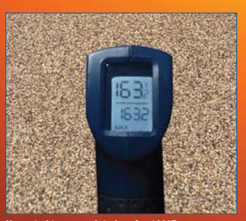
Uncoated tan granulated roof = 163°F