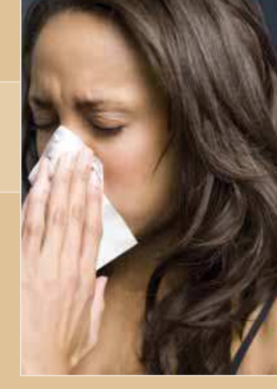
A PERMAX AIRTIGHT SEAL COMBINED WITH A CONTROLLED VENTILATION SYSTEM RE-CONDITIONS THE AIR YOUR FAMILY BREATHES; REDUCING POLLUTANTS AND MICROBES.

How important is that? The EPA estimates that interior pollution concentrations can be 2 to 5 times the air we breathe outside!