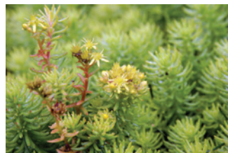
Sedum rupestre 'Angelina'