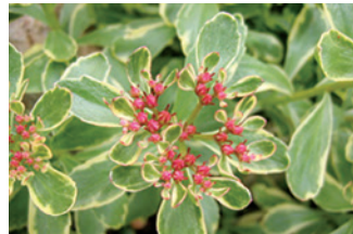
Sedum kamtschaticum k. variegatum