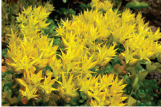
Sedum acre 'Gold Moss'