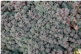
Sedum hispanicum 'Purple Form'