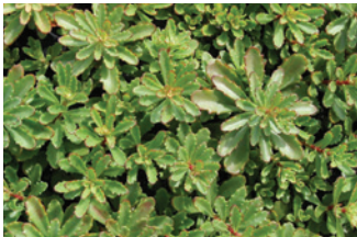
Sedum kamtschaticum 'Weihenstephaner Gold'