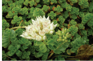
Sedum album 'Coral Carpet'