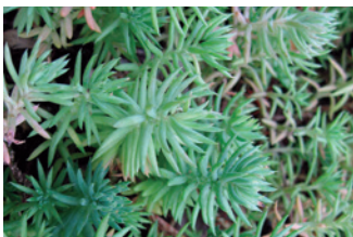
Sedum reflexum 'Blue Spruce'