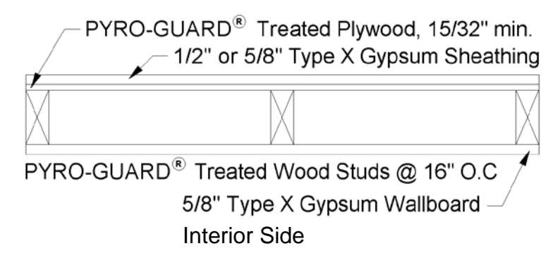
FIGURE 4—1-HOUR FIRE-RESISTANCE-RATED EXTERIOR WALL ASSEMBLY Use where wall is required to be fire-resistance-rated from the exterior and interior sides. (ESR-1791 1-HR)