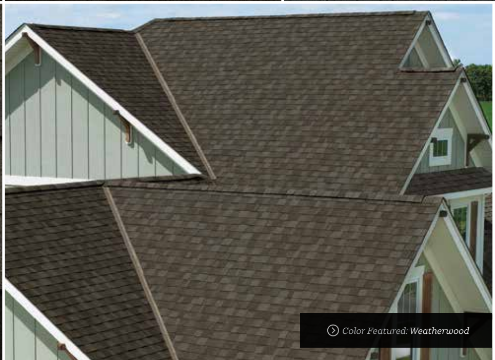
Color Featured: Weatherwood

DRIFTWOOD: Versatile, dark and handsome Perfect Pairings: Log, wood siding, stone or brick facings; brown or black trim. Metal Pairings: Copper, black, nickel, brass, bronze