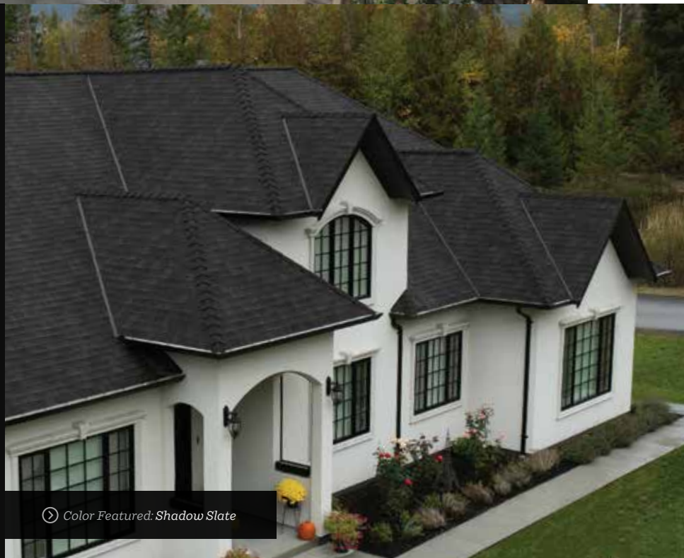
Color Featured: Shadow Slate

ASTM D3462 • ASTM D3018 • ASTM D3161 - Class F • ASTM D7158 - Class H • ASTM E108/UL 790 - Class A • FM4473 - Class 3 6