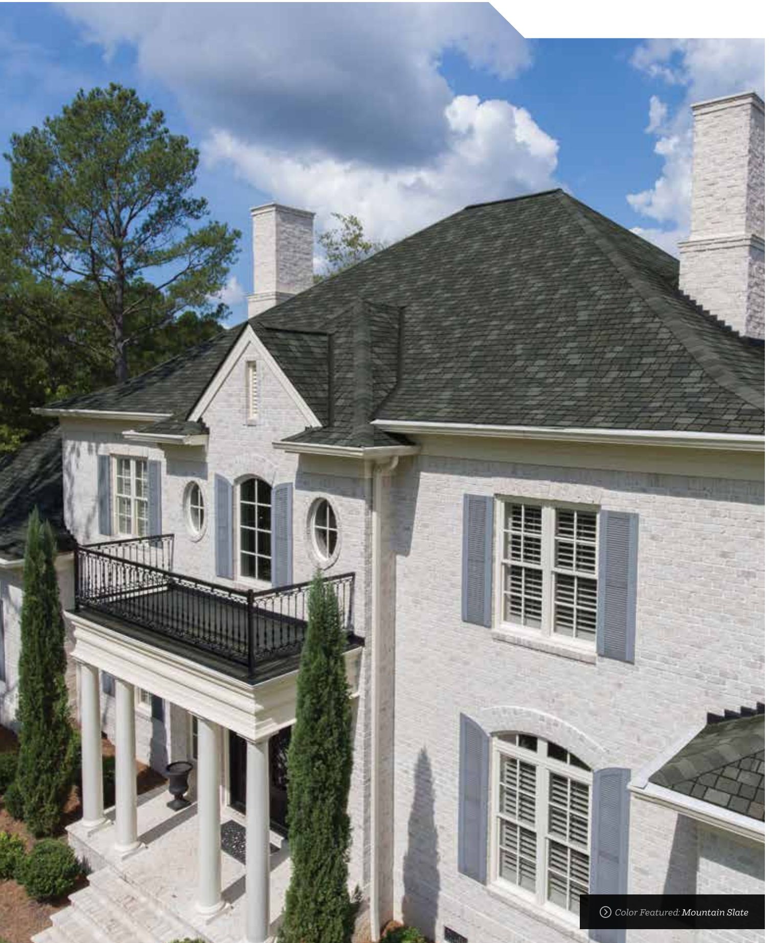
Color Featured: Mountain Slate