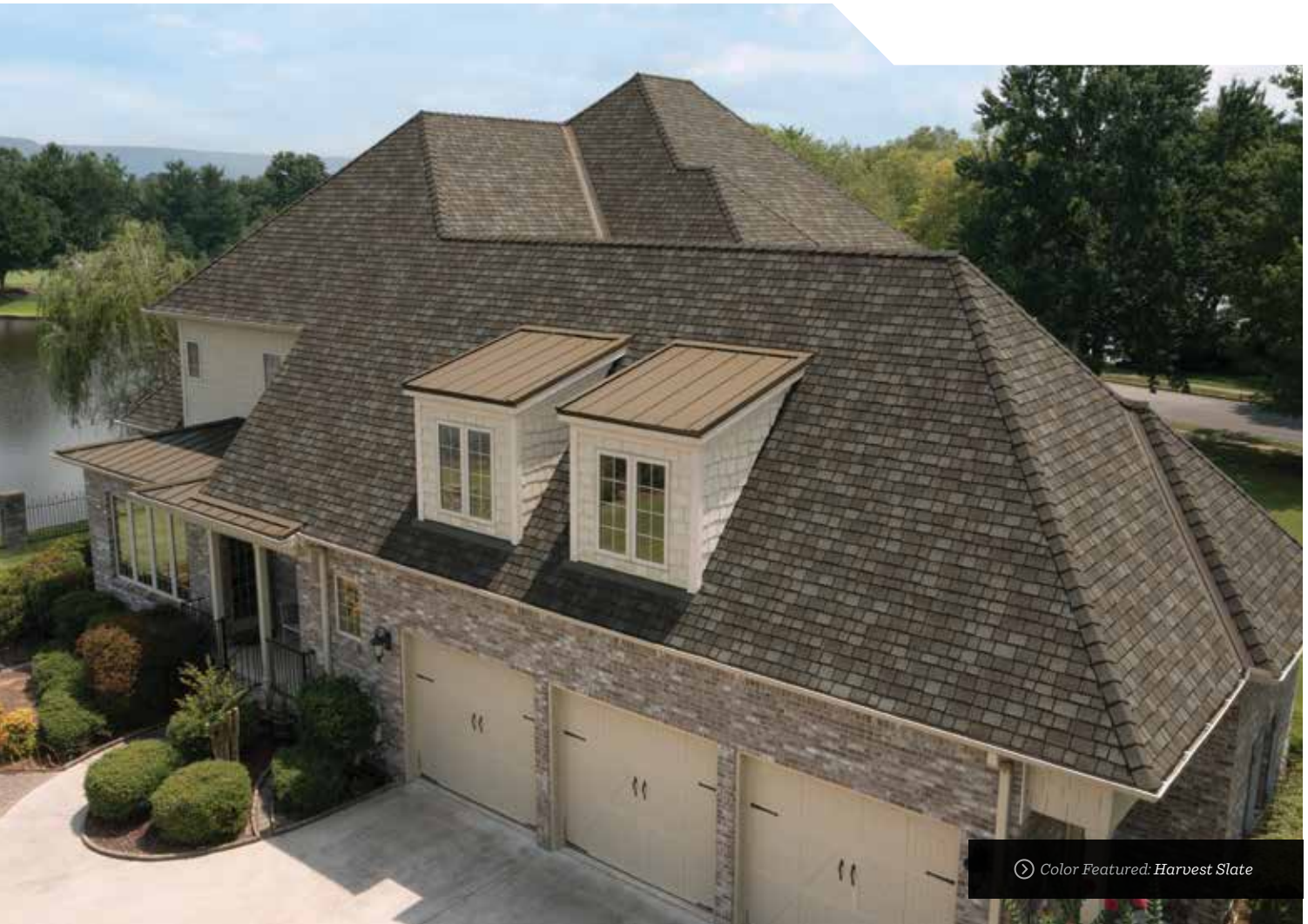
Color Featured: Harvest Slate