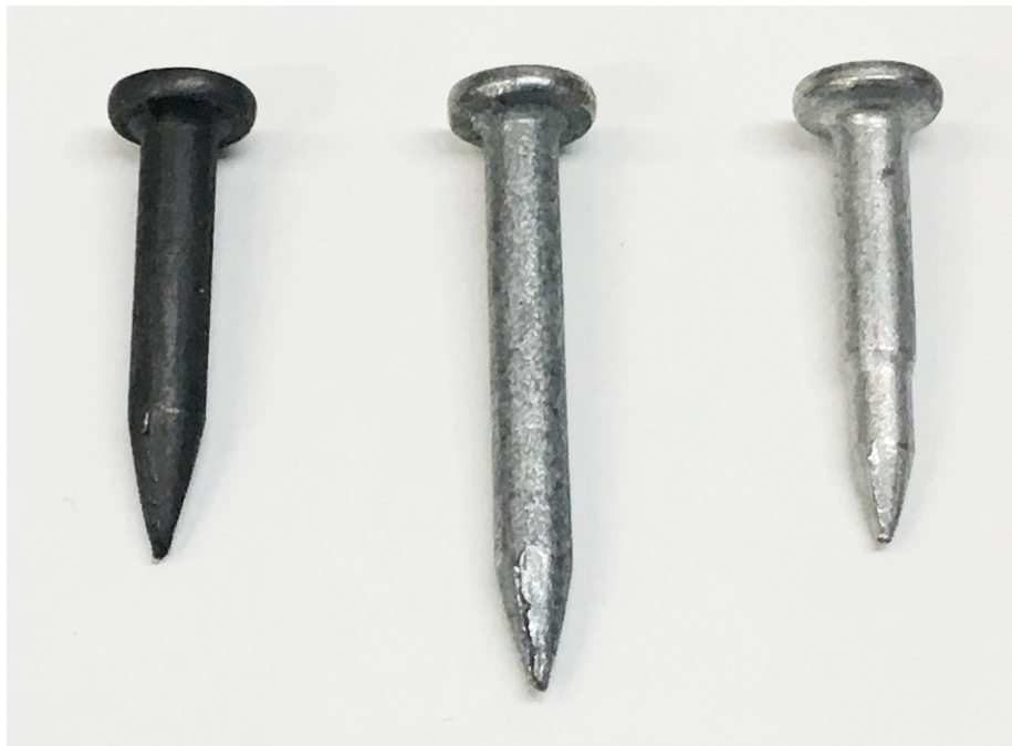
From left to right: T3034B/T4034B, T3100/T4100 and T3034S/T4034S.

3 For steel-to-steel connections designed in accordance with Section 4.1.4, the tabulated allowable load may be increased by a factor of 1.25, and the design strength may be taken as the tabulated allowable load multiplied by a factor of 2.0.