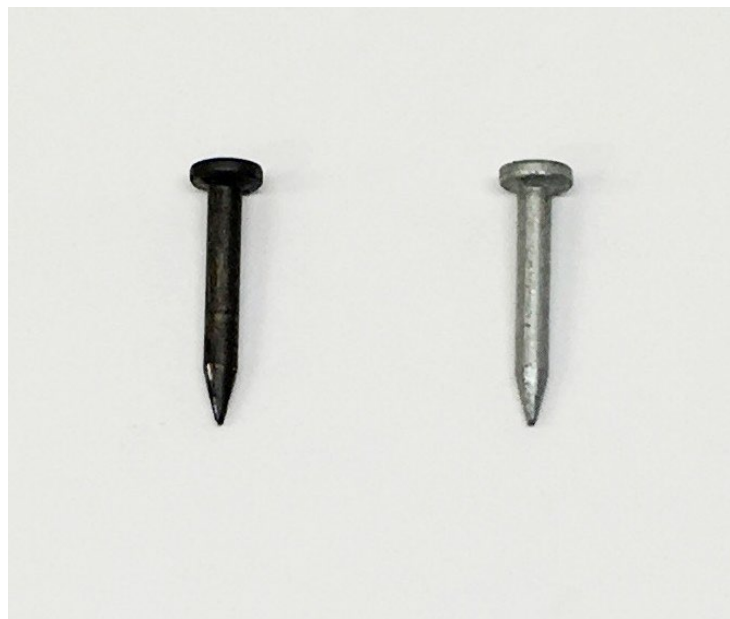
FIGURE 2—TRAKFAST FASTENER