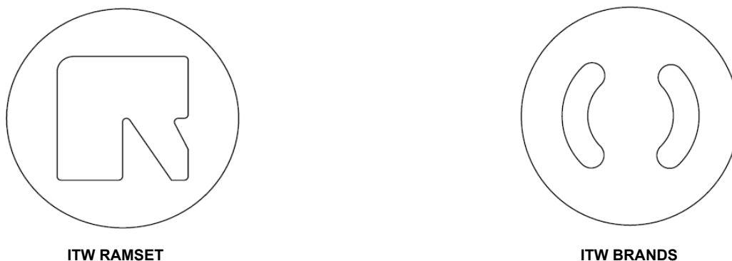
FIGURE 2—FASTENER MARKING