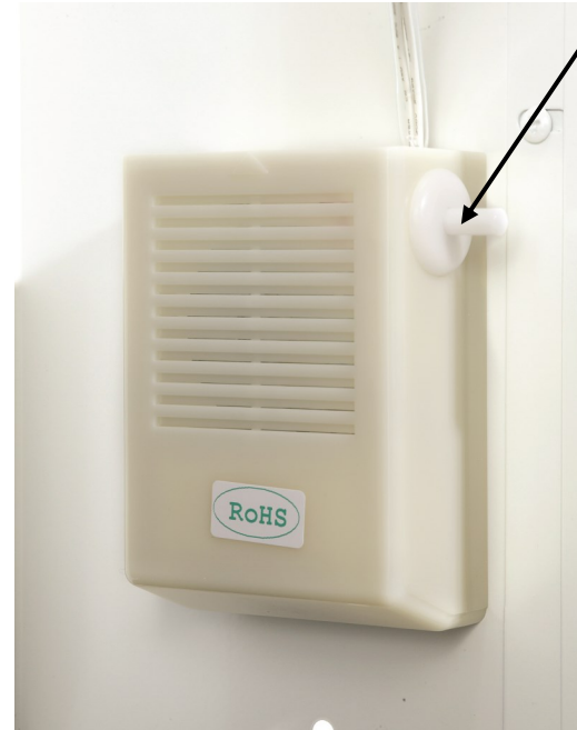
Detail of Alarm Compartment