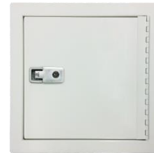
AT Shown with Optional Recessed Flush Locking Latch (AT-1212F2W) (flush latch recommended for ceiling applications)