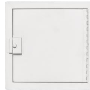
AT Shown with Standard (C5) Knurled Knob & Latch (AT-1212C5G)

Frame & Trim: 16 gauge CRS with 1/2" retainer channel for gasket and 1-1/4" trim flange. Door: 16 gauge rolled and welded. Cam-operated closure with knurled knob (C5) compresses door tightly to gasket. We recommend the F2 Flush compression latch for ceiling applications. Gasket: Fully gasketed on all sides with EPDM rubber. Finish: White powder coat paint.