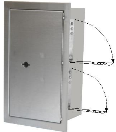
Extend masonry anchors provided, for installation in new masonry construction.