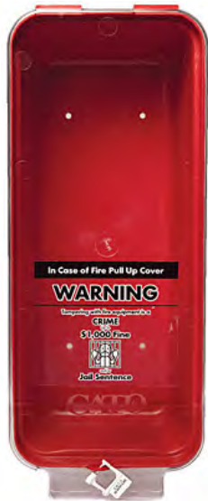
Warrior 95-10 RC

Cato's affordable fire extinguisher series, manufactured in the U.S, provides a dent and rust proof alternative to metal. Cato's Warrior series fire extinguisher cabinet is a two- piece construction with a locking seal. No additional padlock is required. Simply pull up to break the seal and remove the cover to access extinguisher inside.