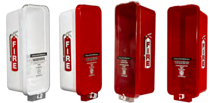
WARRIOR SERIES - TUB/COVER COLOR COMBINATIONS