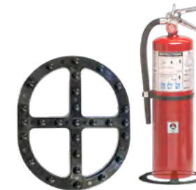
10300 - Fire Extinguisher Rust Prevention Tray Accessory