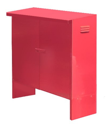
HECIGL OR HECIRL WITH 12" LEGS