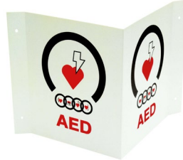
14TS - Tent Wall Sign 7" x 6" x 4.5" - .020 White Styrene