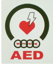
14S - Flat Wall Sign 8" x 11" - .020 White Styrene

These Durable Signs are Screen Printed with High Quality Graphics to draw Visibility to the AED Emergency Station. All are Easily Mounted to the Wall Using Screws.