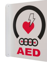
14XS - Right Angle Wall Sign 8" x 11" - 1/8" PVC Printed 2 Sides