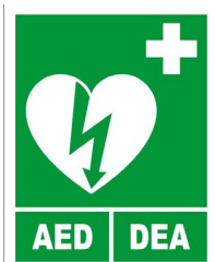
14S-ILCOR - Tent Bilingual Wall Sign 6" x 4 1/2"