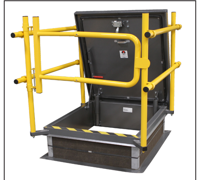
Shown with Optional Safety Gate