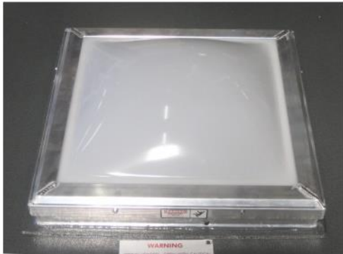
Detail of Dome Construction