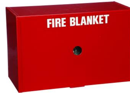
Horizontal Drop Cabinet 9613S21

Surface-mounted tub and solid metal door. The Royal series is available in red epoxy-painted CRS only. Door hardware includes zinc-plated pull handles and roller catches.