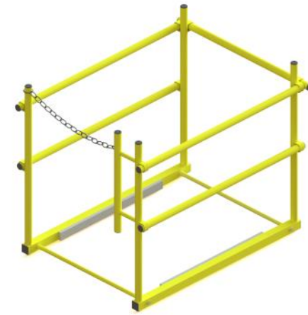
SHWC-3636 SHOWN WITH STANDARD GRAB BAR (Standard with 36" and Greater Egress Side Opening)