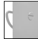
Standard Cam Latch