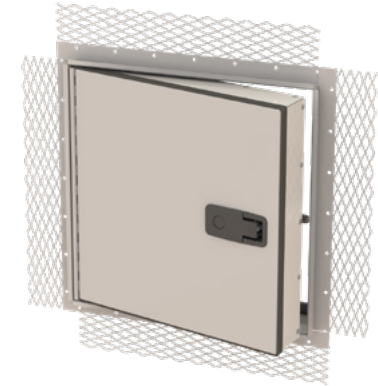
XTEA with Standard Latch