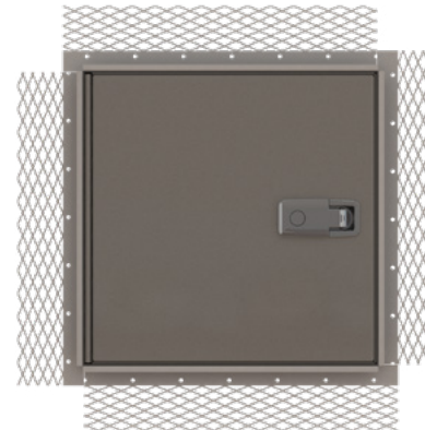
XTES with Optional Latch (F6)