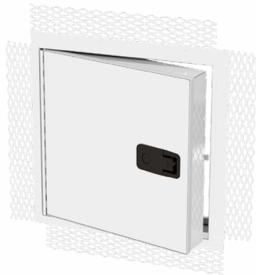
XTEA with Standard Latch

Select this exterior access panel design with energy efficiency in mind. 2 inches of polyisocyanurate provides an R-value of 13, and dual layered gasketing provides the weather-resistance you need. Door opens to 170°.