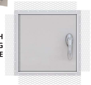
MODEL XPEA WITH NON-LOCKING HANDLE