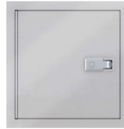
XTS WITH OPTIONAL LOCKING CHROME LATCH

(F6) Chrome lockable compression paddle latch. Optional Colors for XTA