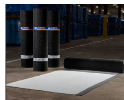
Colors: White, Black & Tan

System Compatibility This product may be used as a component in the following systems. Please reference product application for specific installation methods and information.