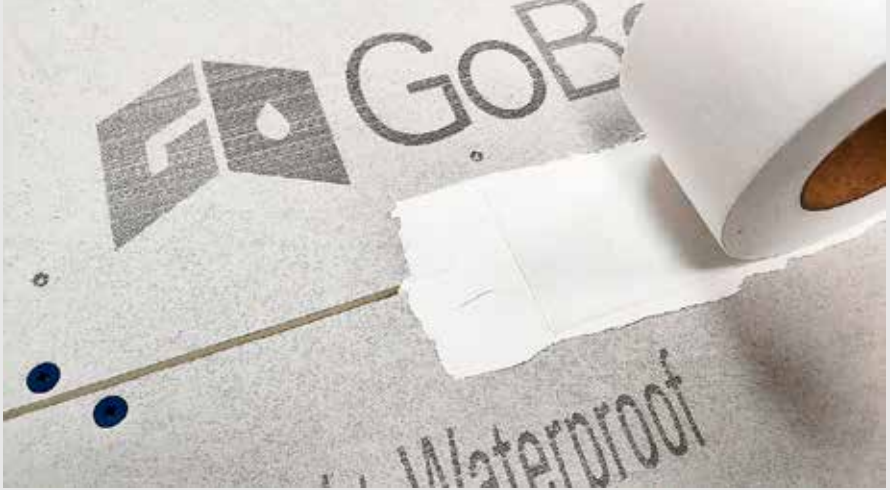
NOTE: Sealant should not saturate and pass through seam fabric.

*Refer to the manufacturer's installation instructions and technical data sheet for fastening schedules for GoBoard Fasteners/Washers combo and approved alternative fasteners. Or refer to the GoBoard Fasteners and GoBoard Washers technical data sheets. (www.JM.com/GoBoard)