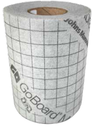
GoBoard® Banding 4.9-in wide

GoBoard Membrane is a flexible and light weight waterproofing and crack isolation membrane constructed from a 100 micron polyethylene waterproofing membrane laminated to polypropylene non-woven fabric on both sides. GoBoard Membrane provides an excellent waterproofing substrate for unmodified and modified thin-set mortars used to bond ceramic, porcelain and stone tiles.