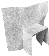
GoBoard® Curb Covers 5.5-in x 7.0-in x 2.5-in