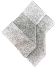
GoBoard® Corners 3.2-in x 5.5-in x 2.4-in