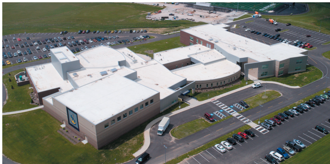
Streetsboro High School Streetsboro, OH