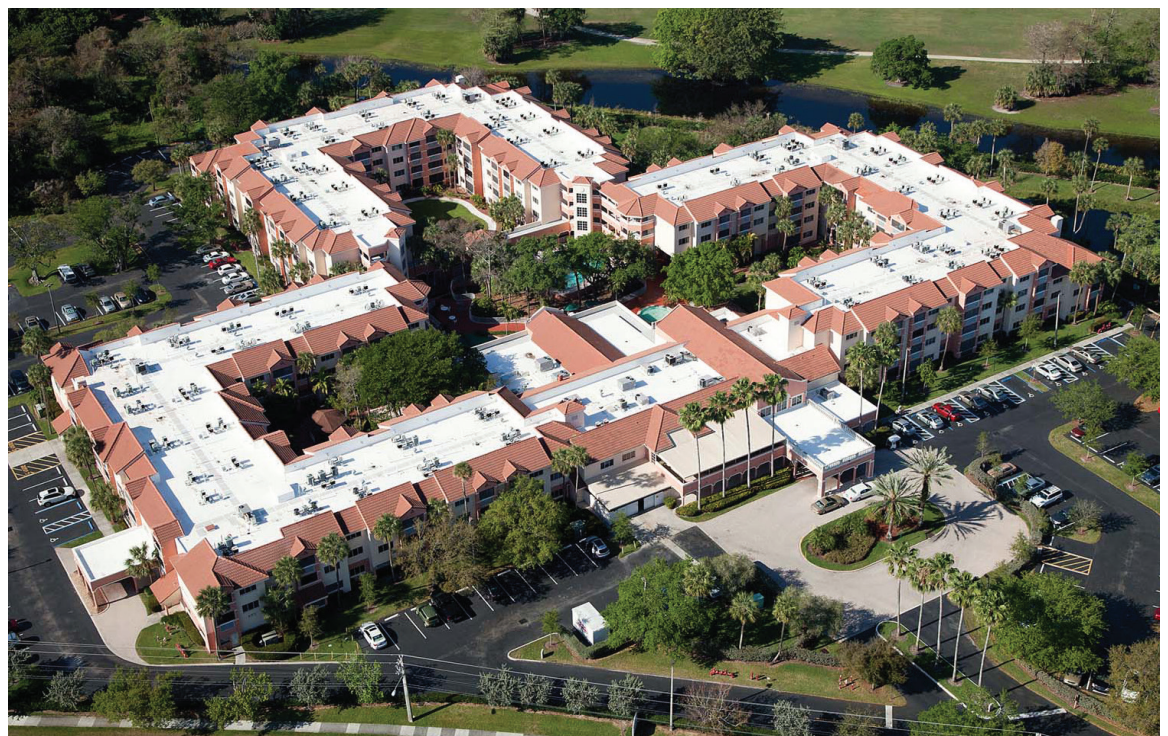
The Preserve at Palm-Aire, Pompano Beach, FL

To learn more visit www.jm.com/roofing .