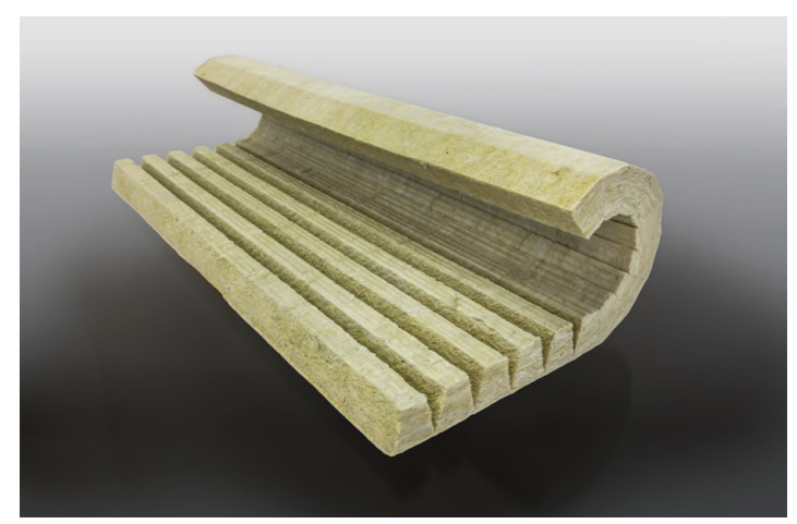
Operating Temperature Limit: 1200°F (650°C)