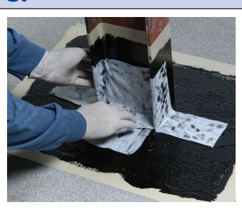
Embed the first piece of PermaFlash Scrim.