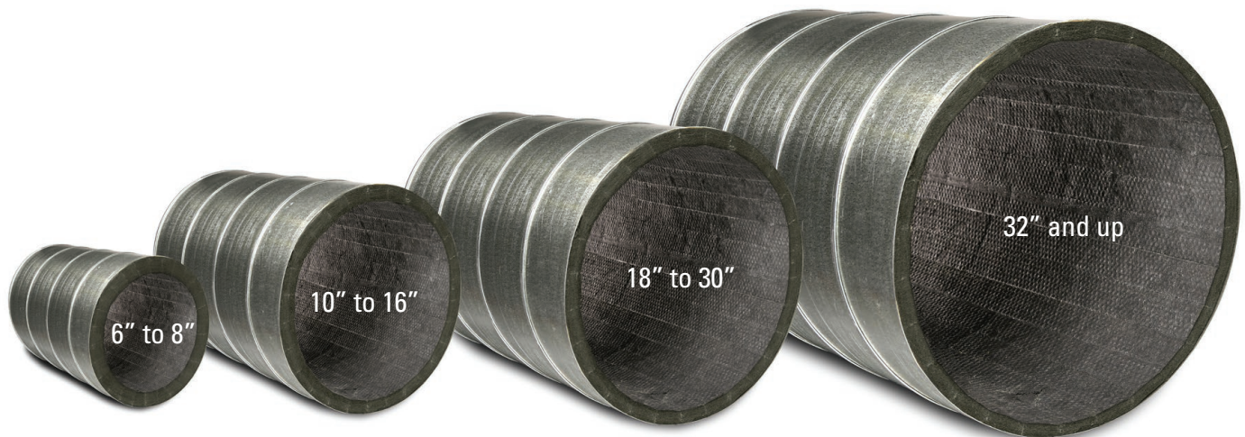
VVSD: Very Very Small Diameter

Spiracoustic Plus insulation is bonded with a thermosetting resin, and the airstream surface and transverse edges are protected using Permacote®, JM's factory-applied, black, acrylic coating.