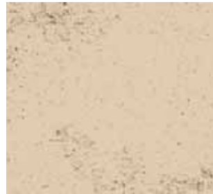
53 Pure Ivory