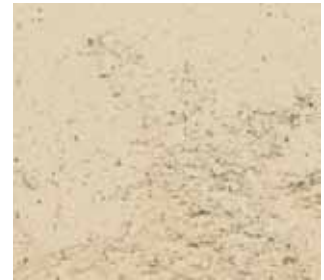
73 Egg Shell