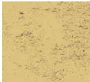
55 French Vanilla