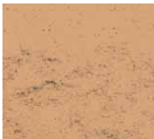
71 Miami Peach