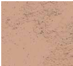
24 Santa Fe