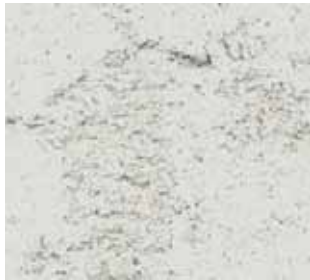
50 Crystal White