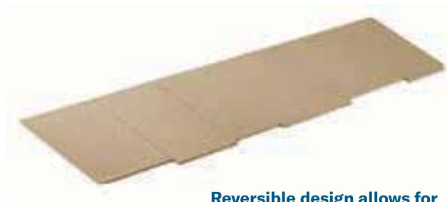
Reversible design allows for staggered or straight edge