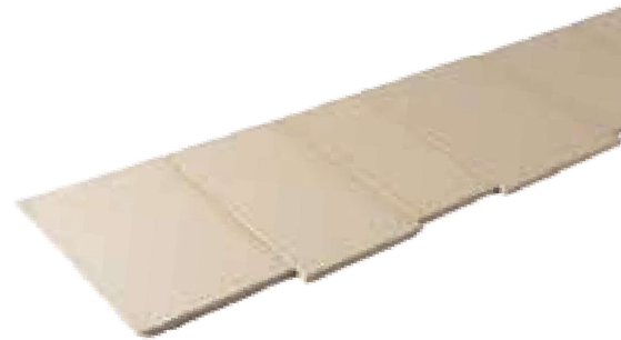
NEW! Brushed Smooth Shake Lap Siding

Reversible design allows for staggered or straight edge