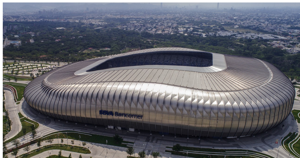
Figure 1: Last projects with Mapecem Quickpatch: Mirabel towers (Vancouver, Canada) - Estadio de Fútbol Club Mty (Mexico)