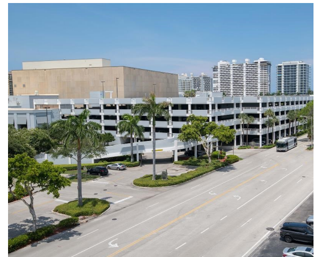
Figure 1: Last projects with Mapefer 1k : The Met Philadelphia (Philadelphia, USA) - Oroville State Theatre (Oroville, USA), The Galleria at Fort Lauderdale (Fort Lauderdale, USA)