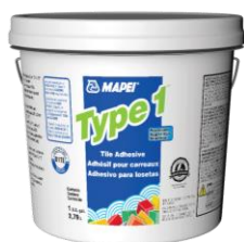
Type 1™ Premium Tile Adhesive