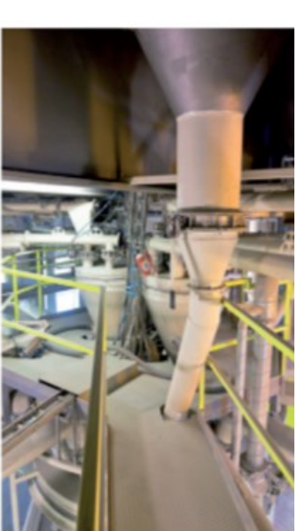
Figure 2: production process detail