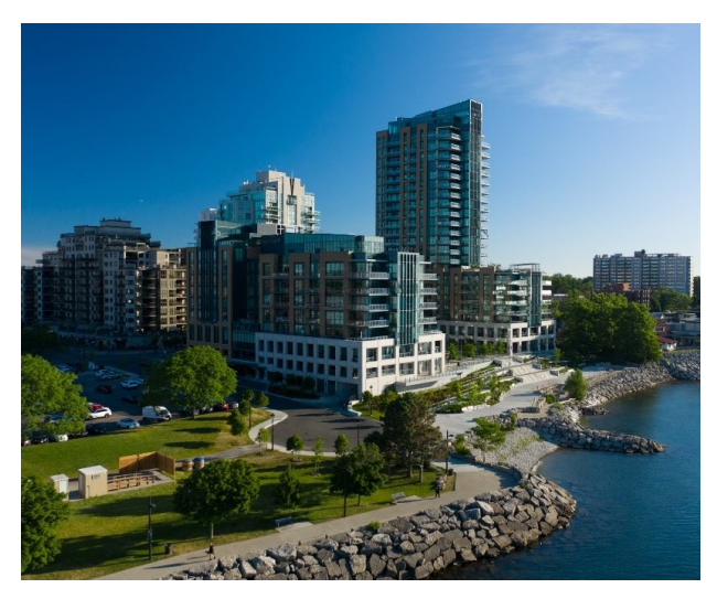
Figure 1: Last projects with Mapei Ultralite Mortar : Fallsview Casino Entertainment Centre (Niagara Falls, Canada) - Grande Prairie Regional Hospital (Grande Prairie, Canada), Bridgewater Residences on the Lake and The Pearle Hotel & Spa (Burlington, USA)