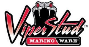
09.22.16 Non-Structural Metal Stud