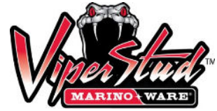
09.22.16 Non-Structural Metal Stud