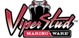
09.22.16 Non-Structural Metal Stud