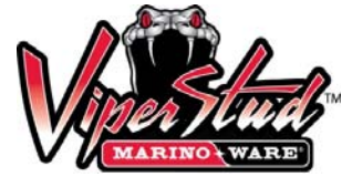
09.22.16 Non-Structural Metal Stud