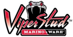
09.22.16 Non-Structural Metal Stud