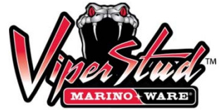
09.22.16 Non-Structural Metal Stud