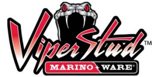
09.22.16 Non-Structural Metal Stud