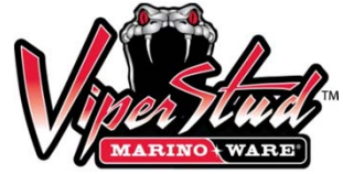
09.22.16 Non-Structural Metal Stud