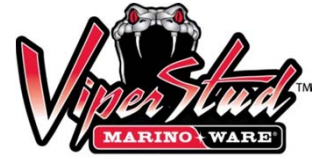
09.22.16 Non-Structural Metal Stud